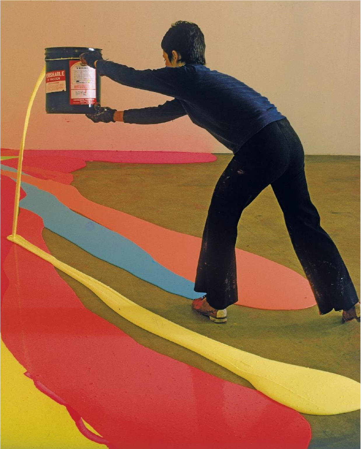
Lynda Benglis, Fling, Dribble, and Drip, 1970